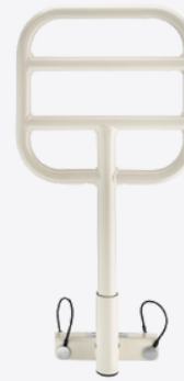
Q Assist Bar