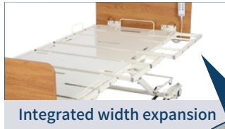
Integrated width expansion