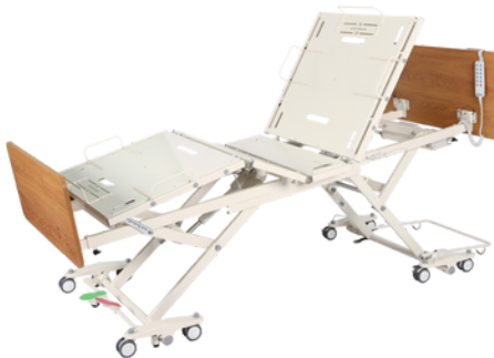
Comfort chair position