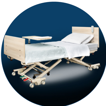
Under bed light