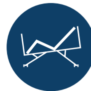
COMFORT CHAIR POSITION