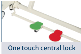
One touch central lock