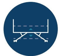
MOBILITY AT ANY HEIGHT