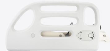
Soft Style Side Rails