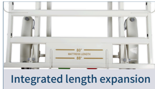
Integrated length expansion