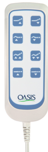
8 function hand control