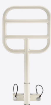
Q Assist Bar