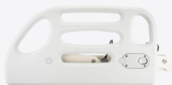
Soft Style Side Rails