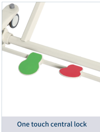
One touch central lock